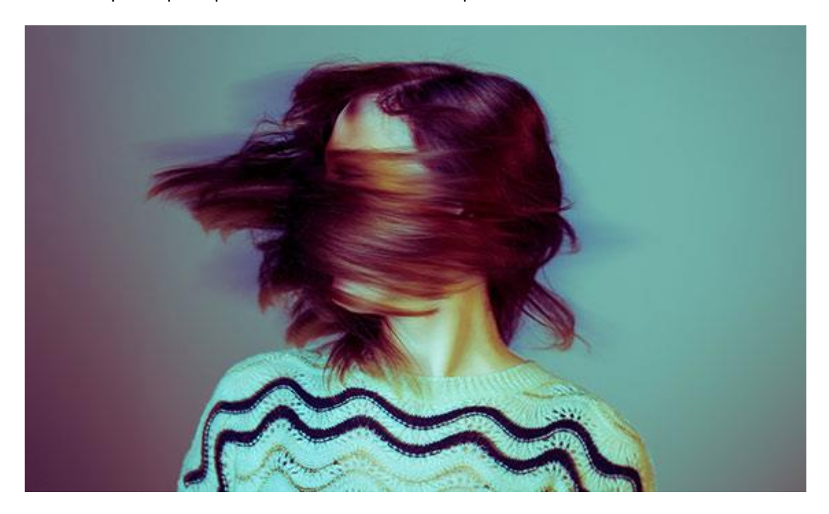
When it comes to neuromodulators, our societies will have to face ethical issues about responsibility and future addiction.

And we might remember that nicotine was used as a 'concentration tool' long before the meteoric rise in the prescription pharmaceuticals that are now put to that use.