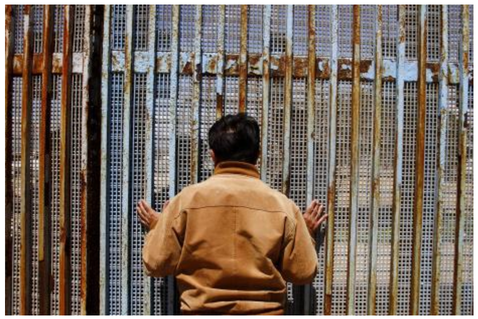
We identify someone as an outsider withing 170 thousandths of a second.

"Us" vs. "them" , cultivating fear and hatred towards out-groups that are deemed different (ethnically, ideologically, religiously, etc.), and vicious and virulent attacks against them, are all part of an unsettling picture of growing ethnic and racial hostility. Philosopher Martin Buber identified two opposed ways of being in relation to others: I-It and I-thou. I-It means perceiving others as objects , whereas I-thou refers to empathic perceptions of others as subjects . Cognitive neuroscientists have studied this distinction with brain imaging techniques and the findings – unsurprisingly – tell us a lot about our increasingly polarised world today and the ways our brains process the distinction between us and "others".