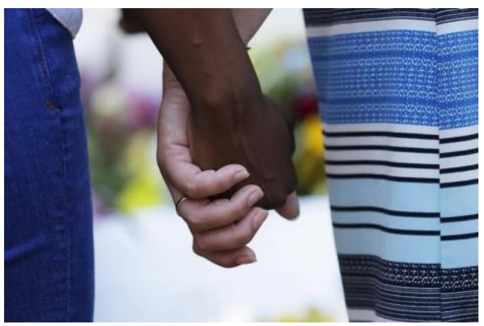
Discrimination still exists, but our brains don't doom us to be biased.

In the US and elsewhere, many have claimed that race-based discrimination has decreased because of egalitarian social norms. This assumption, however, goes contrary to the abundance of evidence showing that prejudices continue.